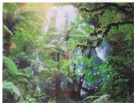
From top: Nature is on your doorstep but comfortable rest is the lodge's priority. Wander off to one of the beautiful waterfalls on the estate or simply marvel at the lush greenery from the breakfast room (left).