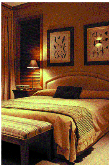
Clockwise from top left Treetops at dawn; the Lodge at night; the Great Room; Waterfall Forest; the Lake View villa bedroom